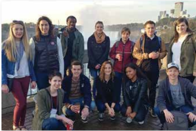
PWRDF Youth Council, 2017

Youth Council is a group of youth and young adults representing ecclesiastical provinces of the Anglican Church of Canada, as well as ecumenical partner organizations.