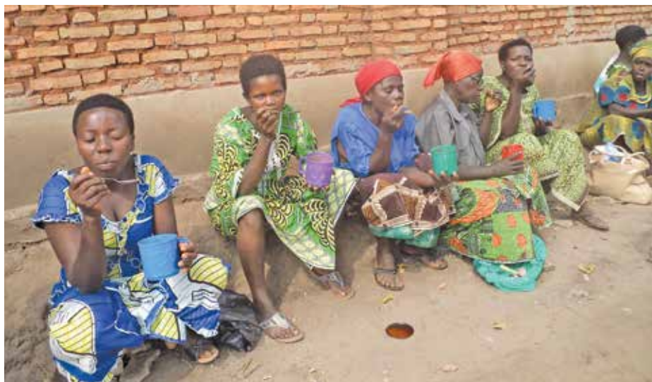
Teaching mothers to cook healthy meals in Burundi.

This Annual Report highlights the exciting news of our Contribution Agreement with Global Affairs Canada (GAC) focused on MNCH in four countries in Africa. When you have read the story, I am sure you will share