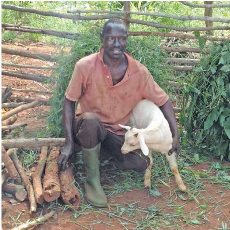
Goats help people to have enough food to eat.