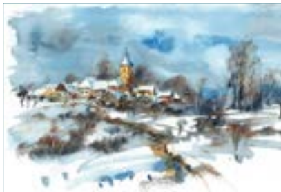
#6 (Anticipation) ___ pack(s)