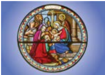
#4 (Three Kings) ___ pack(s)