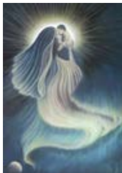
#9 (Light of Life) ___ pack(s)

Cards may be ordered through your PWRDF parish representative or directly from PWRDF as instructed below. A donation of $20 per pack to support our work is welcome. Donations of more than $20 will qualify for a charitable tax receipt.