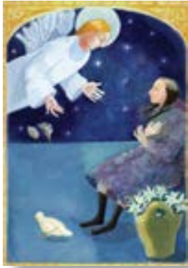
#2 (The Annunciation) ___ pack(s)