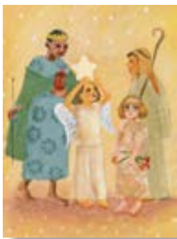
#8 (The Nativity) ___ pack(s)