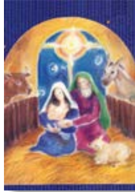
#3 (Holy Family) ___ pack(s)