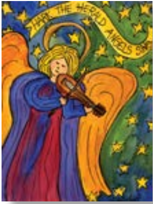
#1 (Angels Sing) ___ pack(s)