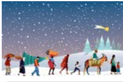
#5 (Christmas Caravan) ___ pack(s)