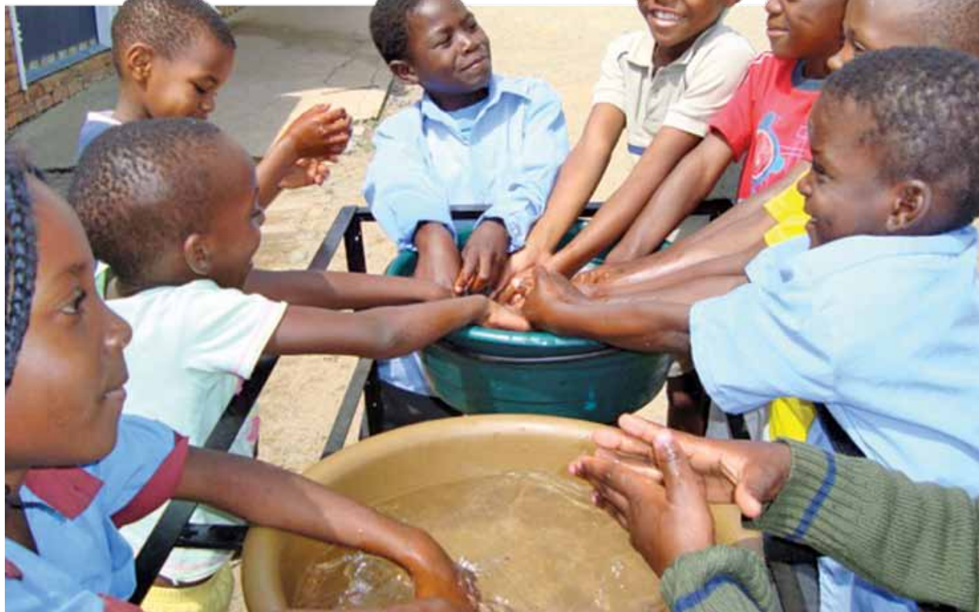
HIV/AIDS orphans wash up for lunch at the John Wesley Centre in South Africa

We can do things together that we cannot do separately. Through 2011-2012 PWRDF has worked to focus and enhance this ministry of the whole body of Canadian Anglicans. Moving forward, PWRDF will focus its programming in the areas of preventive health, food security and microfinance, with fewer partners, in order to deepen relationships and mutual learning. The 2012-2015 strategic plan commits PWRDF to listening to Anglicans in Canadian