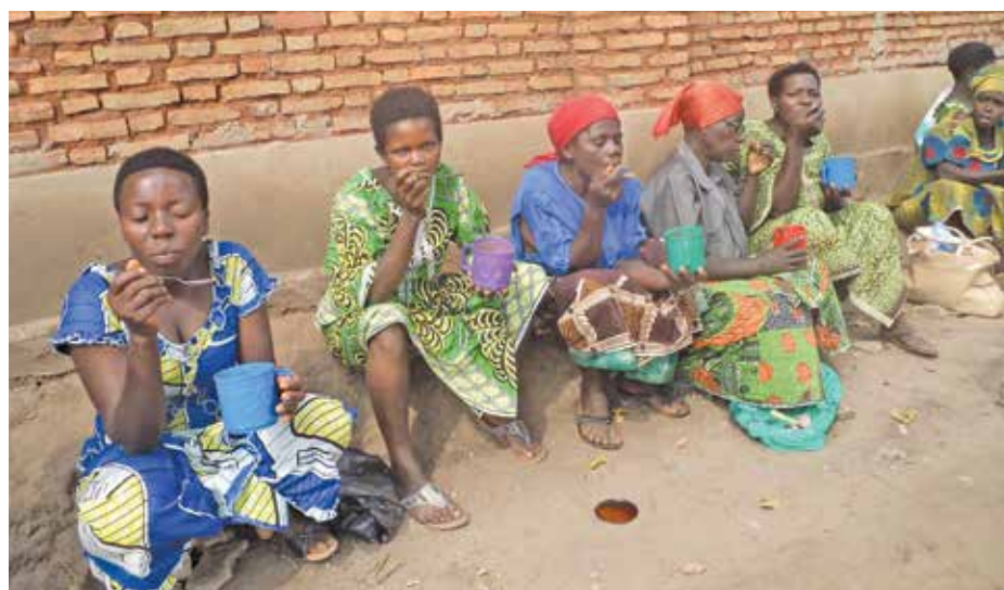
Teaching mothers to cook healthy meals in Burundi.

This Annual Report highlights the exciting news of our Contribution Agreement with Global Affairs Canada (GAC) focused on MNCH in four countries in Africa. When you have read the story, I am sure you will share