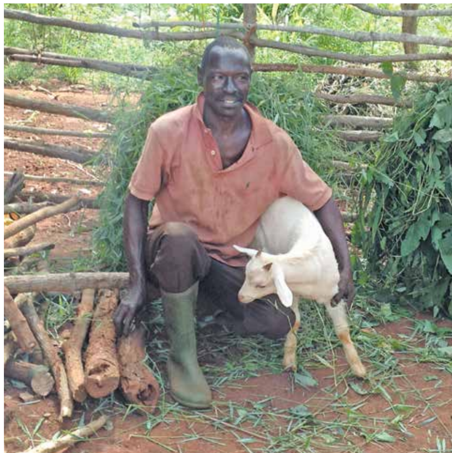
Goats help people to have enough food to eat.