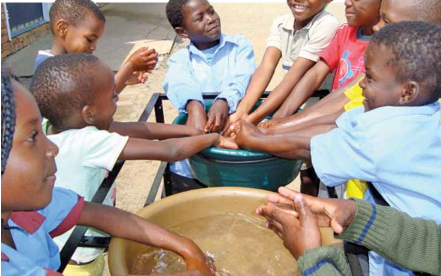
HIV/AIDS orphans wash up for lunch at the John Wesley Centre in South Africa

We can do things together that we cannot do separately. Through 2011-2012 PWRDF has worked to focus and enhance this ministry of the whole body of Canadian Anglicans. Moving forward, PWRDF will focus its programming in the areas of preventive health, food security and microfinance, with fewer partners, in order to deepen relationships and mutual learning. The 2012-2015 strategic plan commits PWRDF to listening to Anglicans in Canadian